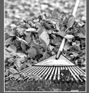
"Jumping in piles of leaves." A.J. Melton (3rd)